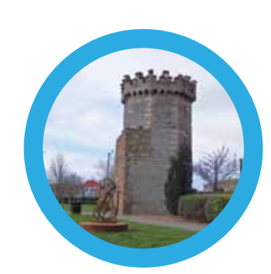
Fountain Heritage Tower